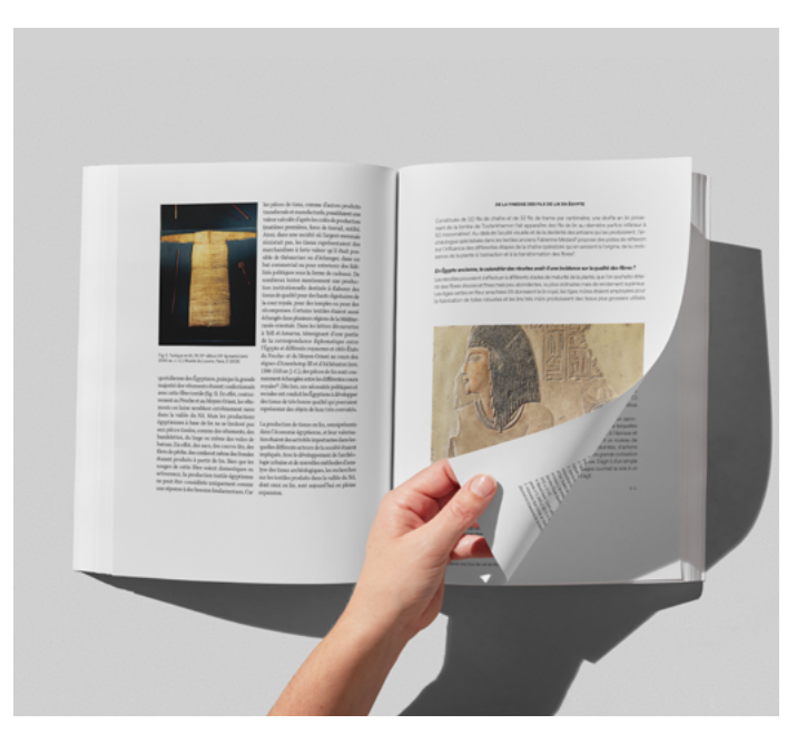
©Book "Flax-Linen, Fibre of Civilisation(s)" ACTES SUD / Alliance for European Flax-Linen & Hemp