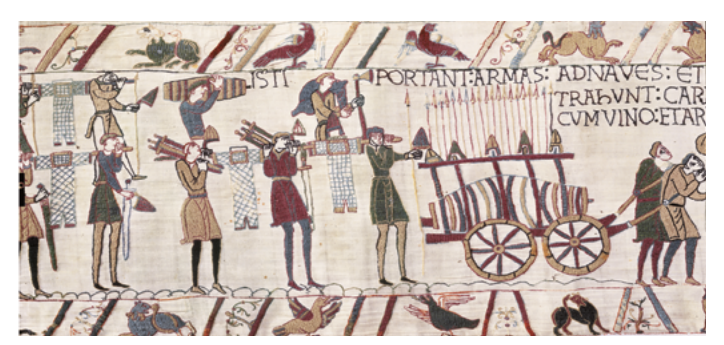
Bayeux Tapestry, woollen thread embroidery on linen canvas, 11th century, 0.5 × 70 m. Scenes 37, 53 and 54 (details). Musée de la Tapisserie de Bayeux, Bayeux.

If the chronology of expertise related to Flax processing, from fibre to Linen fabric, goes back to the Neolithic, it is its intimate relationship with the sacred that gives it a unique status in the history of textiles. Linen has always enjoyed proximity to the divine as a vehicle for ideas about purity and spirituality. In Hebraic and Biblical texts, Linen is synonymous with perfection. The Old Testament contains over 80 mentions of Linen, its purity guaranteed by a rule still in force, the "sha'atnez", which prohibits the manufacture and wearing of mixed wool and Linen fabrics. In fact, it has something to do with the mythical siblings Cain and Abel!