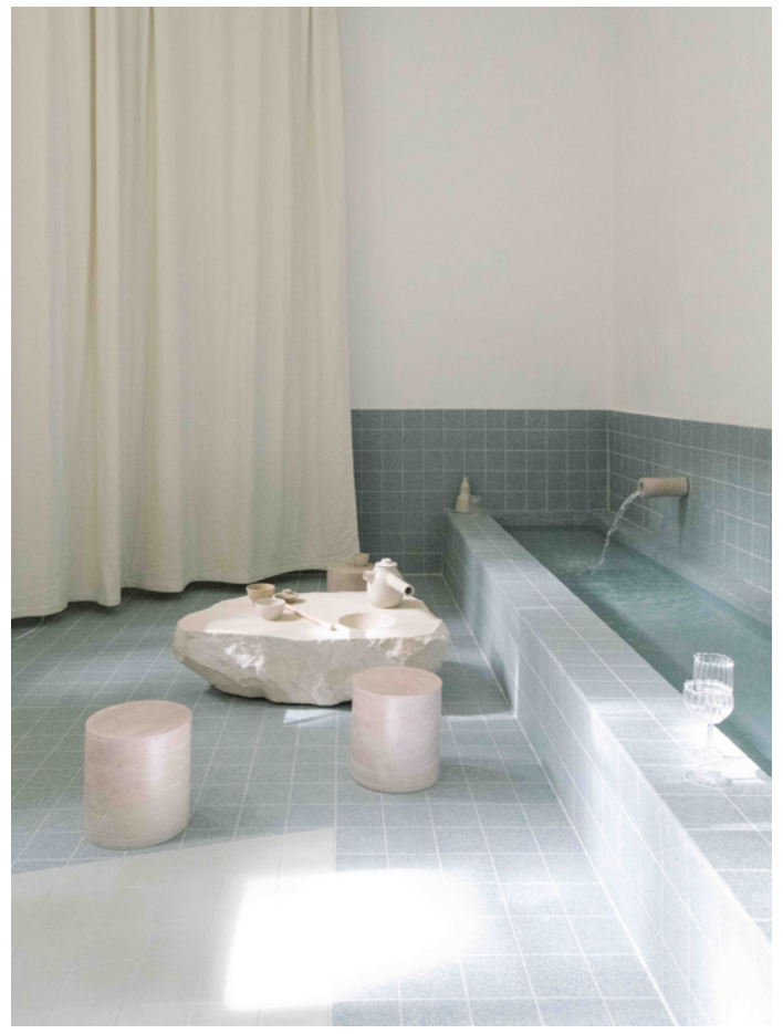
"Les heures chaudes" de Théophile Chatelais & Hadrien Krief ©Villa Noailles