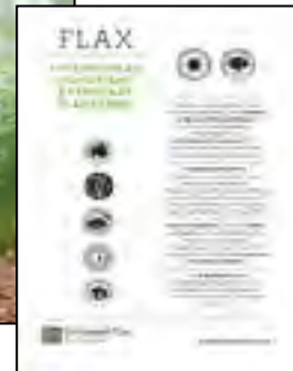
Model of Postcard