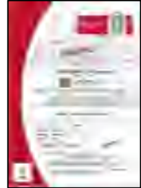
Example of certificate

Certificate is issued by Bureau Veritas (BV), as pdf The certificate is dated, and is valid for 3 years.