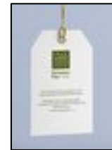
Models of Tags and StoryTelling on products